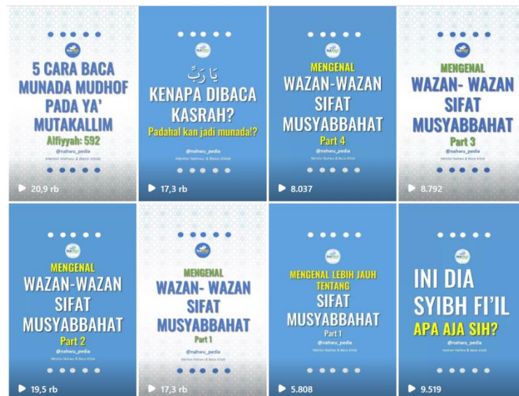
Figure 5. Materials on Rules, Wazan, Wadzifah, and Sighat

Apart from that, the material presented on @Nahwu_Pedia Instagram Reels is also about 'adad ma'dud and also sharing about nahwu at large. The scope of learning material is not monotonous, and uses various sources or references in its content, including: kitab Alfiyah ibnu Majah, Imrithy, Amsilathy, Jurumiyah, and others.