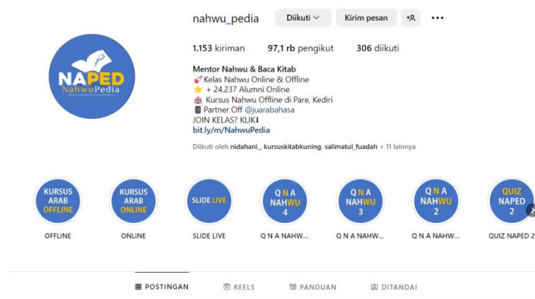
Figure 1. Instagram Front Page @Nahwu_Pedia

The @Nahwu_Pedia Instagram account is one of the Arabic language learning accounts that utilizes advances in digitalization and is affiliated with Al Azhar Pare, which is located at Jl. Cempaka No. 29 Tegalsari Tulungrejo, Pare, Kediri, East Java. Al-Azhar Pare itself is an Arabic language course institution established on the basis of motivation and encouragement to help students and foreign language activists in mastering and developing a second or foreign language quickly and easily 33 . Al-Azhar Pare's Arabic course focuses on speaking skills and reading the yellow book (qawaid). In line with the course institution, Instagram @Nahwu_Pedia was also established with the same purpose, namely as an Arabic language learning account as well as an online course provider that focuses on nahwu and yellow book reading skills.