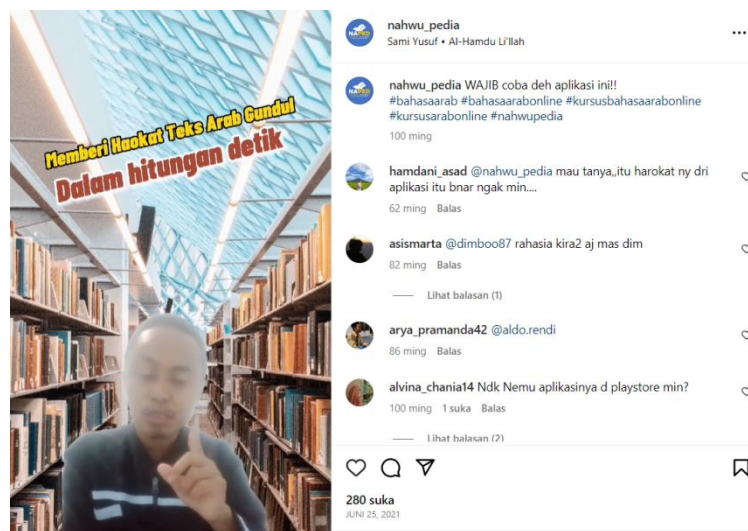
Figure 2. First Reels Upload

On the @Nahwu_Pedia Instagram account, we can see the first upload of Reels learning materials on June 25, 2021 if based on the release time of this Reels feature in the Indonesian region and the format of the feature.