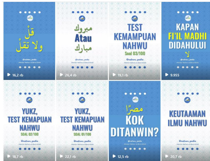
Figure 4. Nahwu Proficiency Test